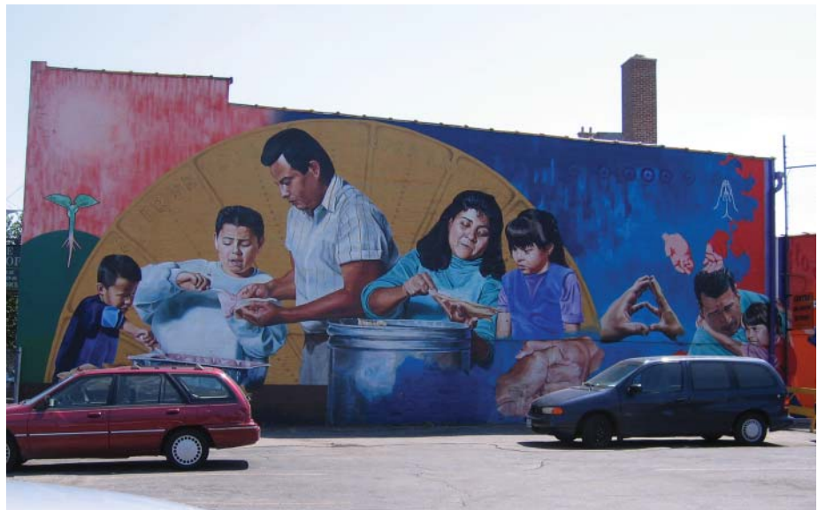
Mural in the Pilsen neighborhood of Chicago

Not surprisingly, ICDI staff report extremely high compliance rates among their participants and attribute these rates to programming that provides participants with the support and information they need to fully understand and engage with the system. It is easy to imagine how programs like ICDI—with proper financial support and staffing—could replace the existing detention system with a cheaper, kinder, and effective method of welcoming and supporting asylum seekers and immigrants to the United States. 22