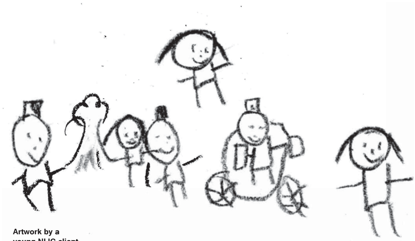
Artwork by a young NIJC client

The first model is the Marie Joseph House operated by the Interfaith Community for Detained Immigrants (ICDI), a community-based non-governmental program operating in Chicago for asylum seekers recently released from immigration detention. ICDI stands as an example of the holistic approach to alternative programming that could easily serve as a replacement for immigration detention in the United States. International models are similarly instructive, and those featured here from Sweden and Canada highlight successful community-based programs operated with the support and cooperation of their governments.