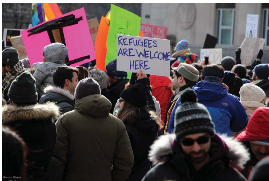
A demonstration in Toronto.

In 2018, the Canadian government embarked on a partnership with three non-governmental organizations—the Salvation Army, the John Howard Society of Canada, and the Toronto Bail Program—to provide “supervision and case management services to individuals released to the community.” 37 This partnership expands on a model created by the Toronto Bail Program, which supports immigrants in