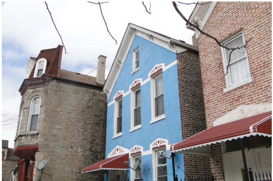
Homes in Chicago’s Pilsen neighborhood

This report is written in three parts. The first part provides a brief overview of domestic and international law regarding the use of immigration detention and an introduction to community-based programming as a humane, cost-efficient and effective alternative. The second part highlights three examples of alternative community-based models operating in Chicago, Sweden, and Canada. The third part contrasts these models with the ATD programs currently in operation under ICE’s management, which run largely at odds with accepted best practices. An appendix following the report’s conclusion provides a bibliography of existing resources documenting the persistent rights abuses, waste, and corruption within ICE’s immigration detention system.