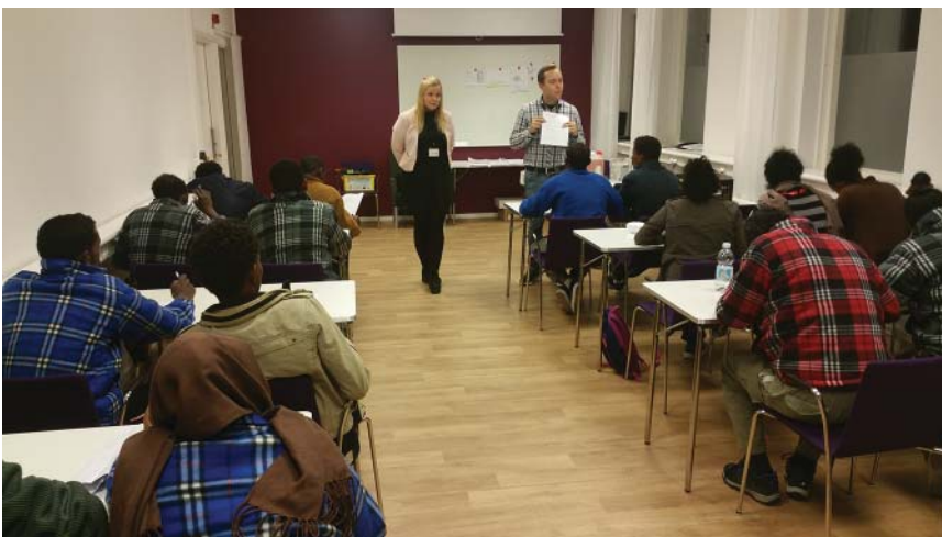
A briefing for asylum seekers ahead of registration at the Swedish Migration Agency.

Sweden's welcoming and supportive approach has proven a marked success. In 2017, 76,640 asylum seekers were registered with the reception centers, with over 35,000 people placed into housing accommodations. 32 The program's success bears out the importance of robust case management in supporting asylum seekers' compliance with the migration process. In Sweden, if an asylum seeker receives a negative decision from the Migration Board they have between 14 and 30 days to either voluntarily repatriate, repatriate with the assistance of a caseworker, or face forced escort home. The vast majority of participants in Sweden's community-based programming, 68 percent, comply with voluntary repatriation when found ineligible to remain. 33