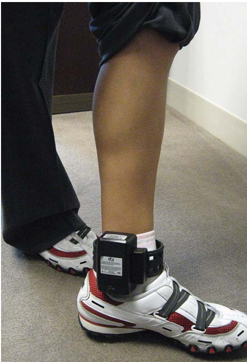
An NIJC client wears an ankle shackle after she is released from detention.