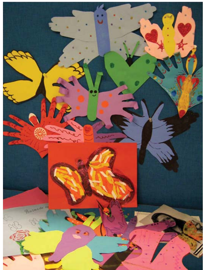
Artwork by Chicago students to be sent to detained families